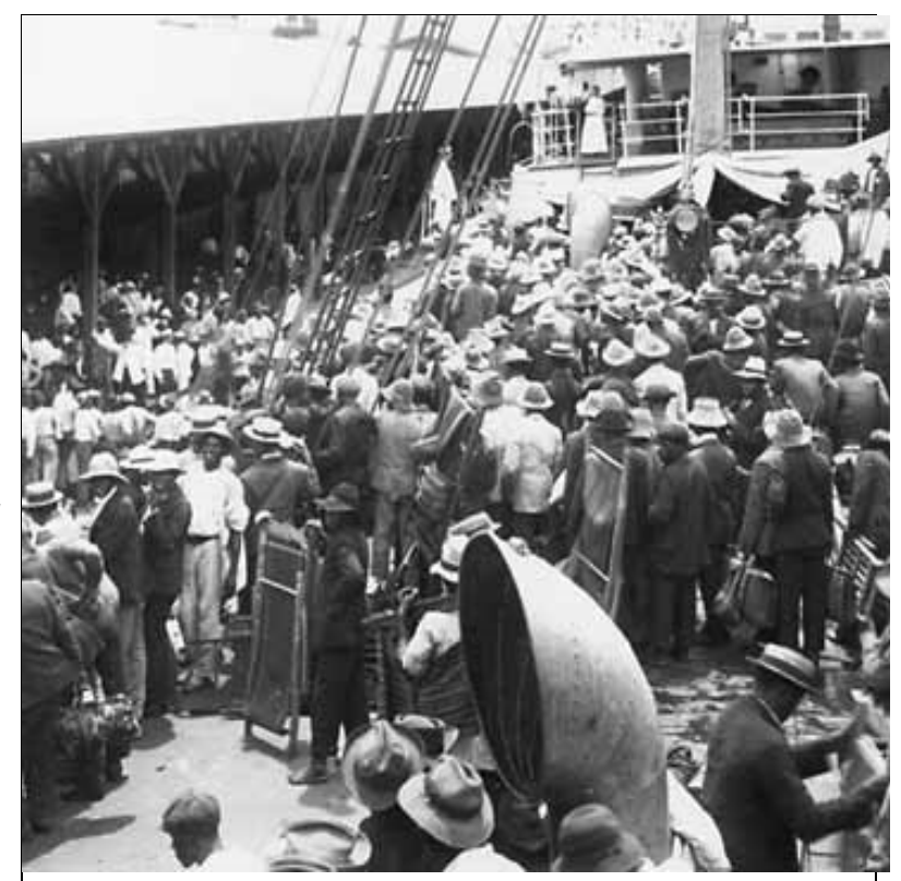
Caribbean workers most of whom were Jamaicans, arriving in Panama, on board the 'Cristobal'