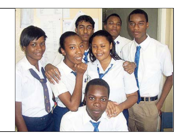
Figure 1: Profile of the Jamaican Population

In small spaces, dual relationships are unavoidable. How it is managed is really the issue. Dual relationships have to be seen in the context of the culture in which one is operating and the size of the community in which one practices. There has to be a conversation about how the practitioner maintains confidentiality and boundaries in such a context. The awareness of self both inside and outside the counselling relationship and the need to be accountable to the client first is important to operating in such an environment. It is imperative that this conversation takes place with trainees and new counsellors so that they have guidance in and an understanding of how to deal with potentially problematic situations. Without this understanding, their efforts in trying to avoid such duality will be fraught with frustration. As western societies become less homogenous there are more small ethnic and racial spaces within each state. How to deal with the importance of religion, social justice and the ethical issues of dual relationships within such situations are other lessons that we from small/developing societies can offer at the table.